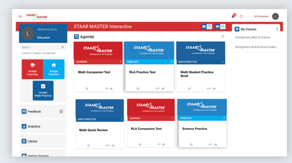
Teachers customize student learning experiences using dynamic dashboard tools.

Teachers gain insight when students self-assess their own confidence in TEKS mastery.